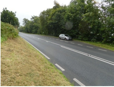
View of tarmacked area on south side of the road.